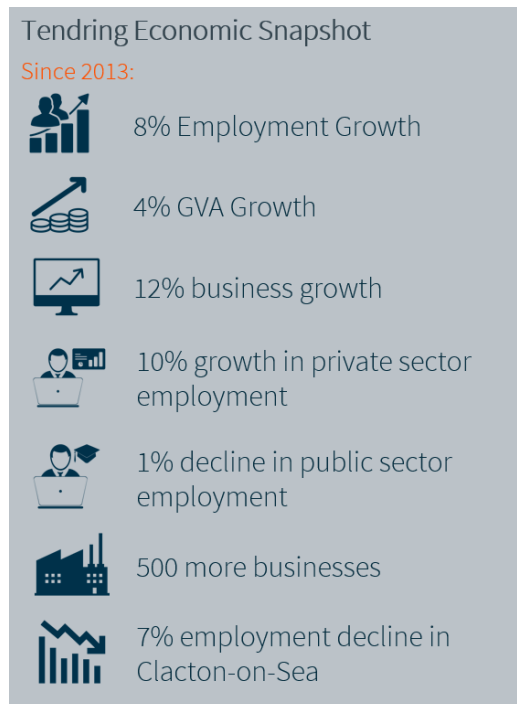
Figure 2.1 Tendring Economic Snapshot