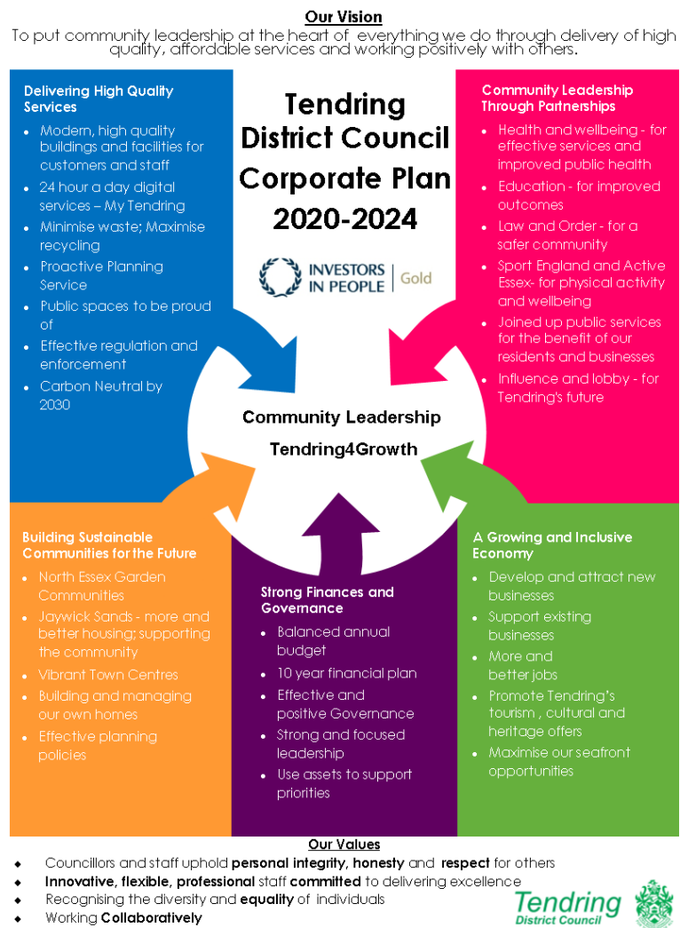
Figure 3.1 Tendring Corporate Plan 2020-2024 Overview

Source: Tendring Corporate Plan, 2016-2020