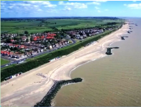
4th July 2015