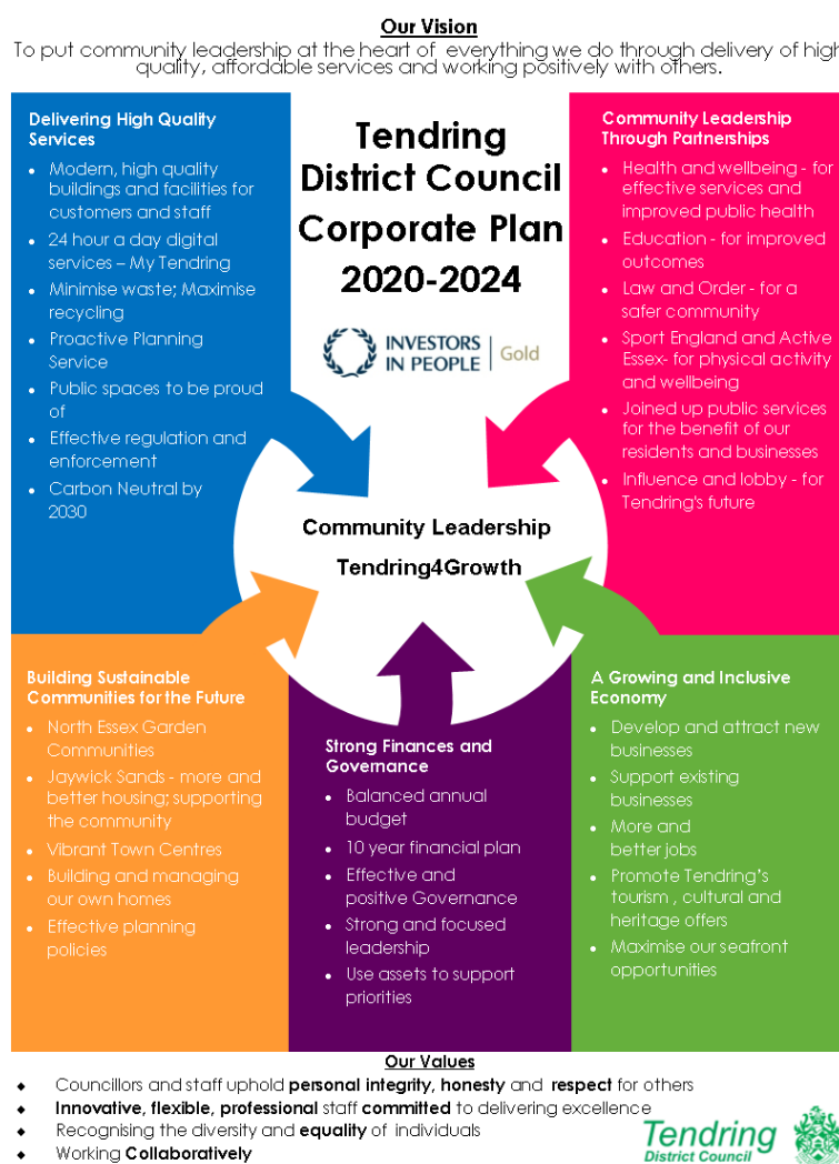
Figure 3.1 Tendring Corporate Plan 2020-2024 Overview

Source: Tendring Corporate Plan, 2016-2020