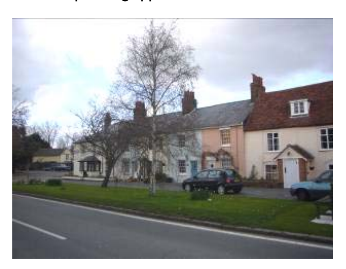
Terrace fronting the greens that line The Street