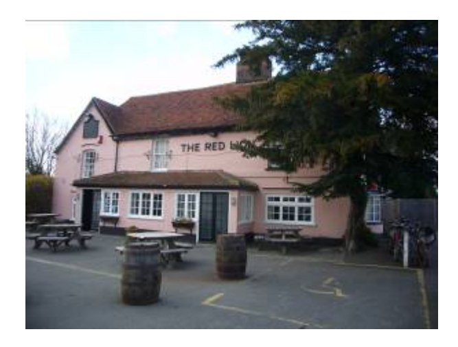
The Red Lion at the heart of the village