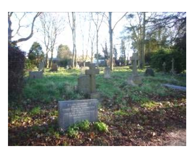
The churchyard is a valuable woodland resource

7.22 While the need to ensure public safety will always come first, enforcement in relation to the historic environment has a high priority because so much historic fabric is irreplaceable. The strategy should also explain the circumstances when the Council would make use of Repairs Notices, Urgent Works Notices and Amenity (S.215) Notices. The latter can be particularly effective in securing the improvement of unkempt land and buildings.