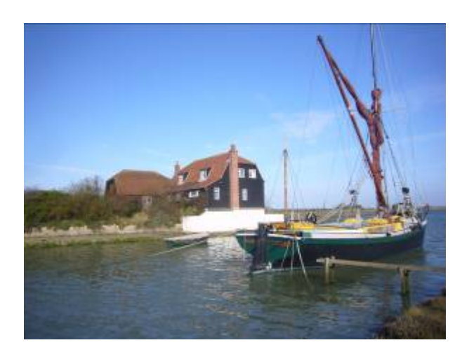
The Quay is a related, but separate, area of special character

7.3 These suggestions have been investigated bearing in mind the criteria for conservation areas that they must be of 'special architectural or historic interest'. While there are certainly some pockets of special interest in the areas suggested, they do not readily link to the existing designation because they are isolated from it by stretches of modern housing that clearly do not fulfil the criteria.