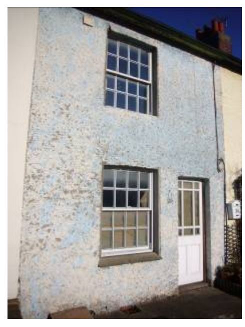
Sash windows retain the character of this cottage

5.12 The approved Local Development Scheme sets out the arrangements for transferring some of the existing guidance into the LDF. In addition, the agenda for the LDF provides for the development of new guidance, to be known as Supplementary Planning Documents (SPD). These include SPD on Open Space and a generic SPD on Conservation Areas. The Council is also committed to reviewing the need to bring forward SPDs on further subjects as issues may warrant and staff resources permit. Clearly, there is scope for the addition of guidance on historic environment issues at the next opportunity.