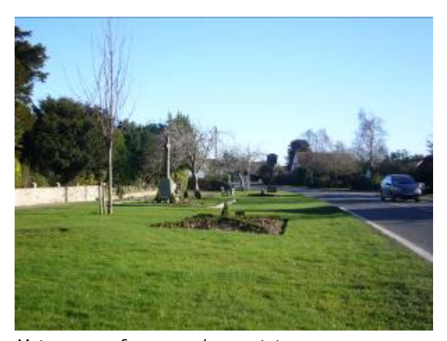
Maintenance of greens and verges is important