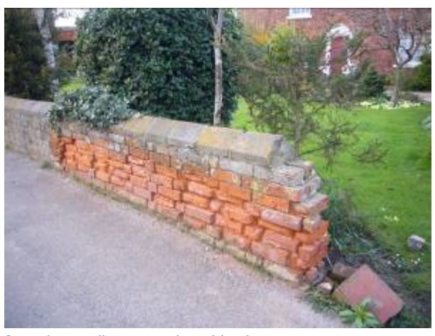
Boundary walls are a vulnerable element