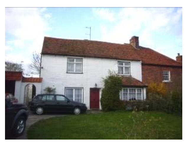
Buildings can make a positive contribution to local character even though they may not be listed

structures may also qualify, such as the war memorial or items of street furniture. Buildings outside the conservation area would also be considered against the criteria.