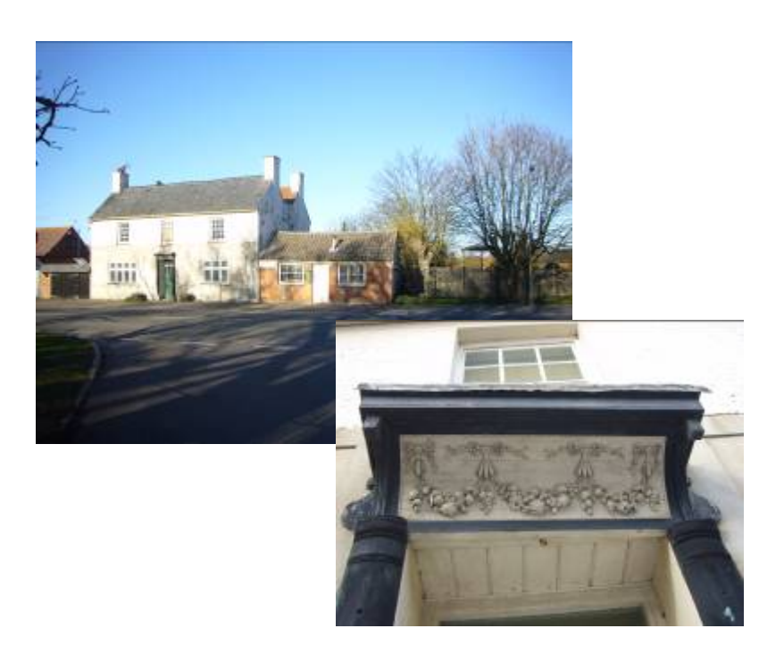
No.34 The Street and its elaborately carved doorway

5.10 In particular, it will be necessary to ensure that the character of the conservation area is defined in the LDF so that characteristics, such as spaciousness and low density can be protected from any threat of over-development.