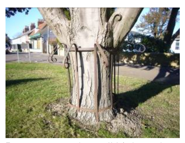
Trees are an important element in Kirby's character, but management is also necessary

3.13 It is a criminal offence to carry out works to trees without the appropriate consent and an offender may be required to replace trees as well as being prosecuted.