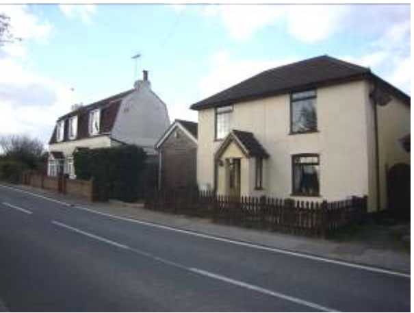
Houses tend to front directly onto The Street