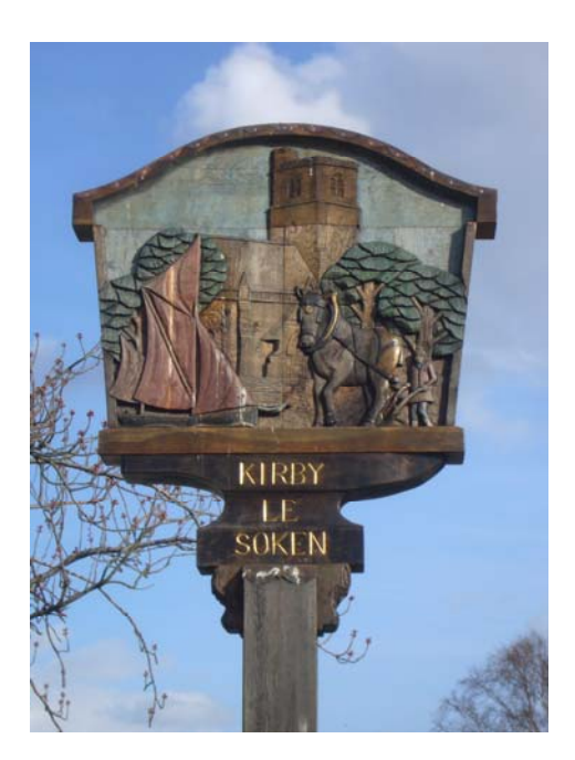
Kirby takes great pride in its identity