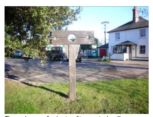
The stocks are a focal point of interest in the village