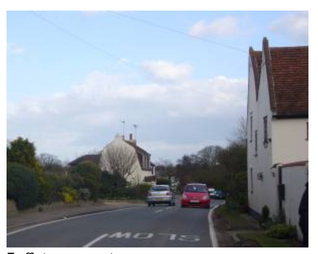
Traffic is a constant issue

6.6 The widening of the main road through the village in the mid-20<sup>th</sup> century, and the steady increase in the volume of through traffic using the route to access Walton-on-the-Naze, has had a significant impact on the special character of the conservation area. The success or failure of future traffic management schemes will have a great impact on the amenity and appearance of Kirby as a whole. The speed and volume of traffic is already considered to be one of the main issues affecting the character of the conservation area.