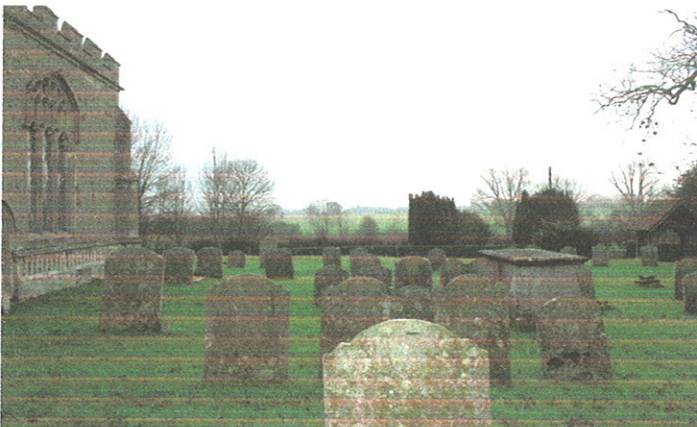
The Churchyard looking East