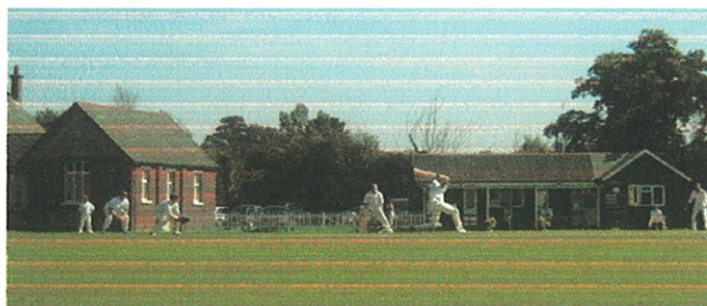
The Village Cricket Ground

63% of households considered that physical recreational facilities in the village were adequate. The remainder would like more to be provided, the most popular being a hard-surfaced area for ball games including tennis and basketball. There was also support for improvements to the existing facilities on the Hare Green Recreation Field, which were regularly used by 20% of households. 12% of households regularly used the vicinity of the cricket ground, primarily for dog walking.