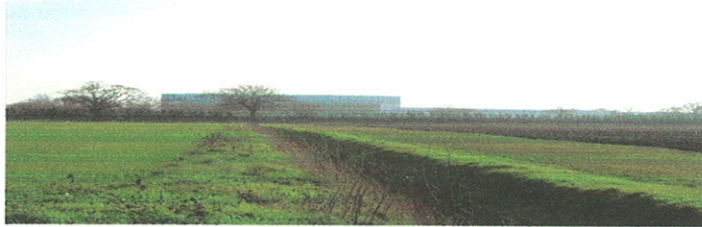
The Book Service Warehouse viewed from Hare Green

Only 2 households supported the provision of large-scale industrial land and associated housing in Great Bromley. 47% were against any employment-generating development at all, although 45% supported small scale development including farm diversification.