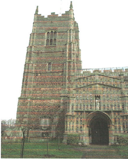
St George's Church Tower

59 households, of whom 24 worshipped at St George's, considered themselves to be active members of a church. Irrespective of religious belief or zeal, over 75% of respondents considered the upkeep and conservation of St George's Church as a historic building to be important or very important to the village.