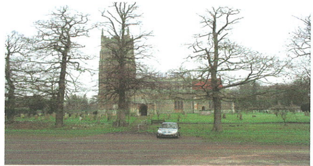
St George's Church viewed from Church Meadow

The majority of households were in favour of one or more changes to Church Meadow. 51% were in favour of discreet, low level lighting; 38% were in favour of hard surfacing a greater proportion of the grassed area; 39% supported the provision of a small play area for young children and 31% wanted to ban overnight parking.