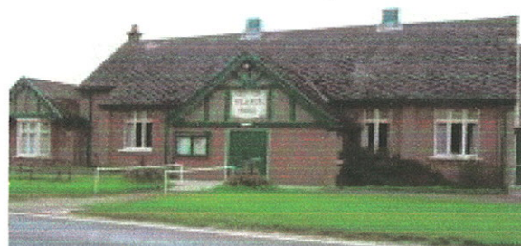
Great Bromley Village Hall

activities. This is a very different situation to that of fifty years' ago when the majority of residents had jobs locally, were less mobile and there were a large number of sports and other recreational clubs active within the village.