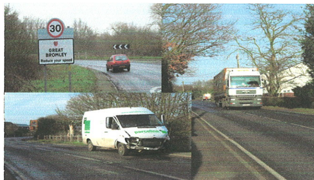
Typical village traffic scenes

Most households were worried about the large and growing number of motorists speeding through the village and wanted the police to take more effective action to dissuade them. 45% considered that the parish council should invest in visual warning signs in an attempt to get drivers to slow down. 31% supported the introduction of traffic calming measures in some locations. Most also considered there to be dangerous junctions or other hazards in the village which could be improved, greatest concern being expressed about the: Selectacars crossroads; A120/Harwich Road junction; Cross Inn junction; illegal parking at Selectacars; visibility at the Mary Lane South/