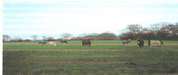
Ponies grazing alongside Mary Lane North

The children at St George's School were keen for the village to adopt the overgrown area between Brook Street and Springhill Close. They would like to be involved with making a nature area and small village green.