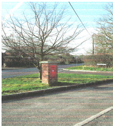
The Post Box at Balls Green