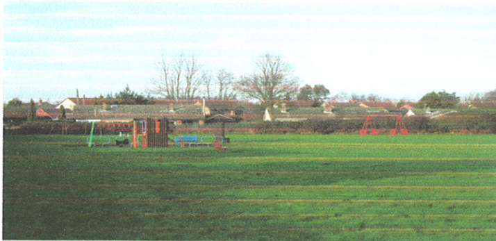
Hare Green Recreation Field

A total of 33 'teenagers' aged 11-17 years completed the youth section of the appraisal questionnaire. 76% of them enjoyed living in Great Bromley, citing quietness; cleanliness; personal safety/low crime levels; friendly neighbours; easy access to towns; proximity to nature/countryside; convenience; good schools; cricket club and the Hare Green Recreation Field as reasons to be positive about the village. However, they generally disliked the following aspects of village life: lack of things to do; speeding vehicles/road safety; dog fouling; poor public transport; lack of facilities; lack of community spirit; no broadband in some parts; vandalism and overgrown footpaths.