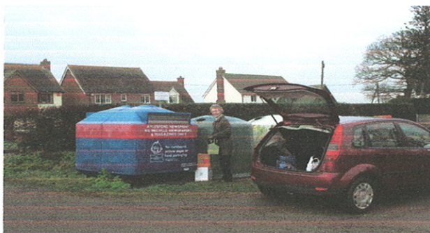
The Recycling Facility on Church Meadow

Hare Green/Balls Green and Cross Inn/Burnt Heath areas.