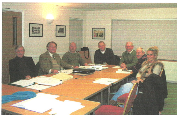
The Parish Council at its February 2007 meeting

Less than two thirds of households knew any of their elected council representatives at parish, district and county level, indicating that better communication is required to ensure that councillors can be contacted direct if required and local issues of concern discussed on an informal basis.