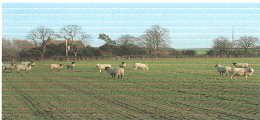
Sheep grazing at Badley Hall Farm

The appraisal results and village plan will be sent to Tendring District Council, Essex County Council, The Rural Community Council for Essex, Essex Police and other relevant organisations for information. It will then be up to the parish council to take the initiatives forward. The large amount of work to be done is clearly outside the capability of parish councillors alone and it will be essential to work with village organisations and residents. Without the active support of these groups, it will not be possible to plan and resource the many initiatives identified by villagers as necessary to improve further the quality of life in Great Bromley.