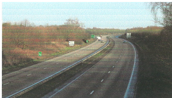
The A120/A133 Junction at Hare Green