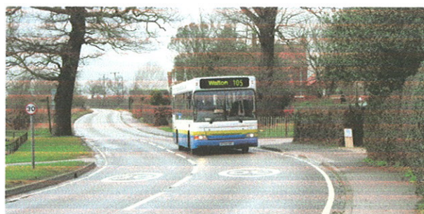
The local bus service to Colchester/Walton

Teenagers in particular were frustrated by the lack of bus services in the evenings, which curtailed their opportunity to participate in leisure activities.