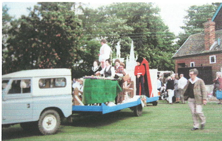
A Float at the Great Bromley Carnival

Over 60% of households considered that the general environment was the most important characteristic of the village. The convenience of the location was most important to 21%, with the community being of prime importance to only 13%. The overall knowledge of the village amongst some households was poor and several were keen to learn more about it and its people, its facilities and history as well as becoming more involved in village activities.