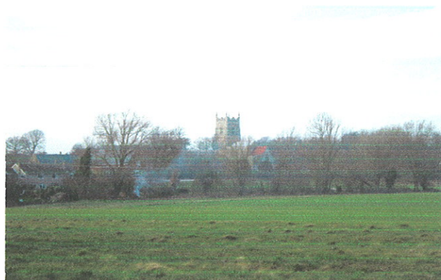
St George's Church from Mary Lane North

Almost all respondents were content with the way that the parish council discharges its responsibilities. However, there were many suggestions for improvement including: closer involvement and better communications between councillors and residents at a personal level; a better understanding of what the parish council responsibilities are and who is serving on it; the involvement of more villagers in parish council initiatives to get things done more quickly and the production of a parish plan with occasional updates on progress.