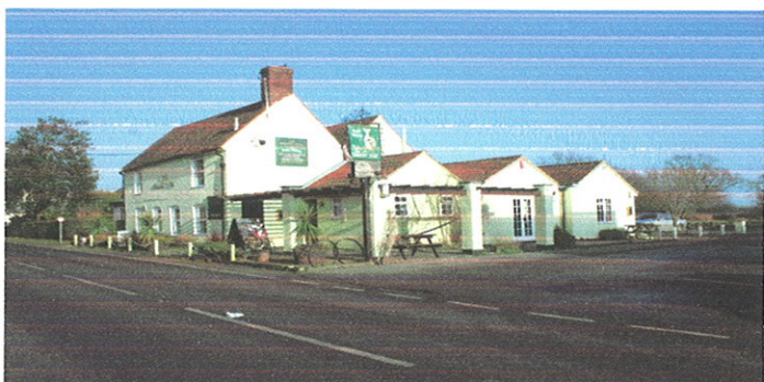
The Snooty Fox Public House in Frating Road

Based on their likely use of a village shop, 51% of households believed that investment in such a facility could still be justified, despite the fact that the post office and shop that recently closed in Brook Street had been struggling for several years. There was particular support for a shop in Brook Street from children at St George's School.