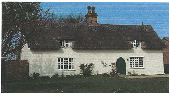
The Old Post Office

The Parish of Great Bromley lies within the Tendring Peninsula and is located some 7 miles east of Colchester and 5 miles south of Manningtree. The parish covers an area of 1212 hectares of mainly good quality agricultural land interspaced by small areas of woodland. The north of the parish is rural in nature and relatively sparsely populated, as is the centre of the village in the vicinity of St George's Church and Primary School. The village was effectively divided into two parts with the building of the A120 trunk road in the early 1980s and it is in the more densely populated Hare Green and Balls Green areas to the south of this road that the majority of the households in the village are located.