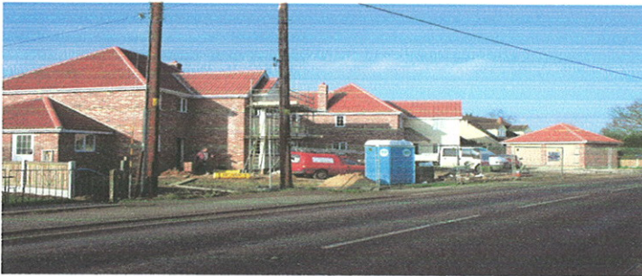
Housing Development in Frating Road

The majority considered that additional housing should be built in the village, but limited to 12 'affordable houses' (42%); that infill should be allowed within existing settlement boundaries (36%) and small scale developments of up to 10 houses allowed (22%).