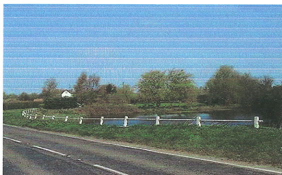
The Village Pond

The parish council considered that consultation should take the form of a village appraisal for both adults and teenagers within the village. Feedback from younger children would be gained from discussion work within St George's School. A working group, comprising three parish councillors and three representative members of other organisations within the village, was established in early 2006 with the task of designing a suitable questionnaire and analysing the results. The questionnaire was distributed to all households at the end of May 2006, with responses due to be returned to the parish clerk by mid-July. The questionnaire contained 105 questions of specific relevance to the village and the answers were analysed in conjunction with the 2001 National Census results. The full appraisal results document, the appraisal report (this document) and a summary report for the parish magazine were published in March 2007 and copies also uploaded to the village website.