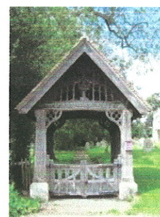
The Lych gate

The close proximity of Great Bromley to Colchester, with its wide range of shops, facilities and good employment opportunities has resulted in the village being little more than a 'dormitory' for residents' work and leisure