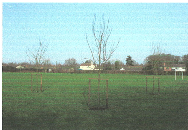
Tree Planting at Hare Green

When assessing the community spirit in the village it must be remembered that more than half of all households failed to return their completed questionnaires. Presumably, many of these households are not interested in playing a role in the community. Of those households who did respond, over 93% were satisfied generally with Great Bromley as a convenient and pleasant village in which to live. Over 45% considered that the existing community spirit was average, whilst 25% considered it to be strong and 13% to be weak. Over 56% of households considered themselves to be involved in the community, with half the remainder not being involved because they did not have time or no existing activities interested them.