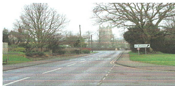
St George's Church from Brook Street