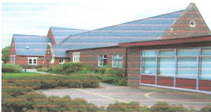
St George's C of E Primary School

Just over 200 adults responding to the appraisal were in employment, with 110 being retired. 75% of those in employment worked within 10 miles of home, with 15% employed within the village. Only 20 adults were not in employment.