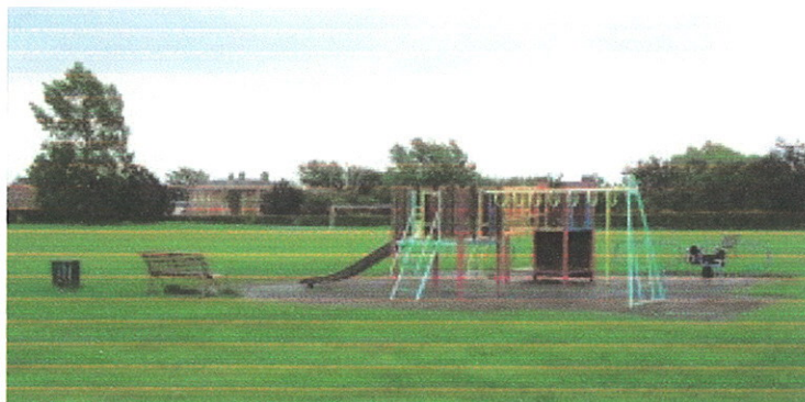
Young Children's Play Equipment at Hare Green

The number of adults volunteering to help organise each activity is shown in brackets. There is clearly potential for at least some of these activities to take place in the future.