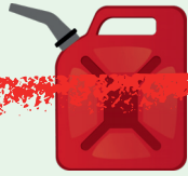
Oils & Liquids